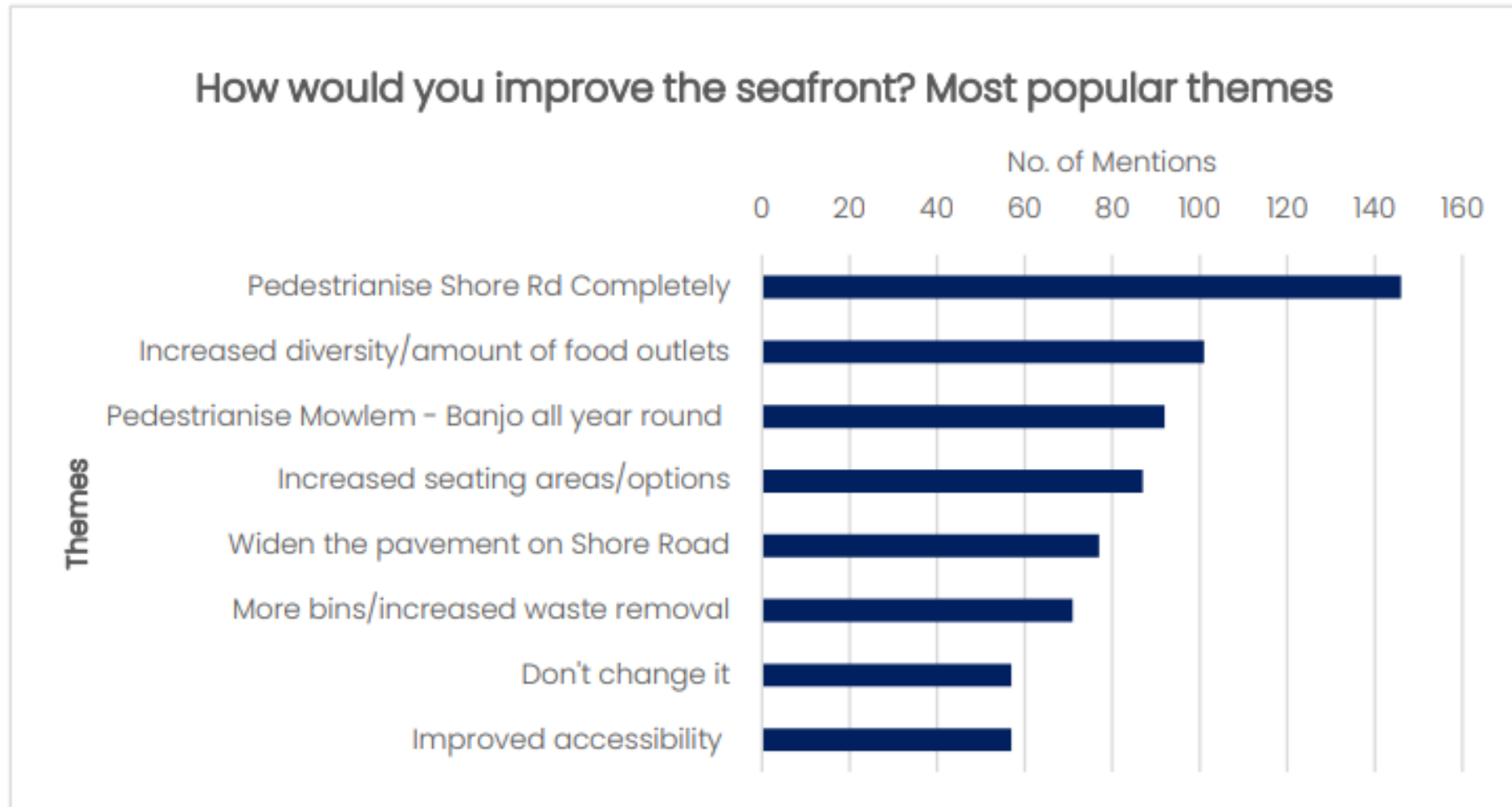
Figure 1: How would you improve the seafront? Most popular themes – Survey Question 8