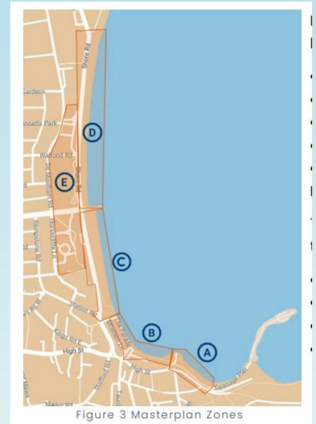
Figure 3 Masterplan Zones