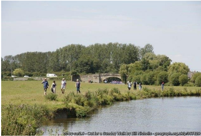
Work & business

There are many reasons why people choose to live near rivers and water.