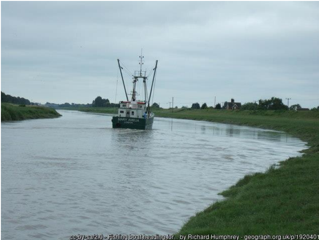
Fishing boat heading for...

People, goods, animals and food could be transported in boats along the river in times when there were no proper roads.