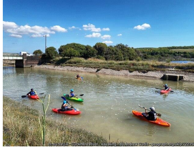
Fun & sports